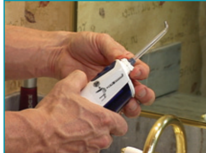
Follow manufacturer's directions