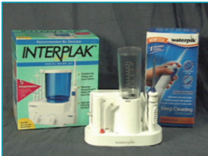
A variety to choose from

No matter why you've chosen an oral irrigator, you'll get the best results if you use it correctly.