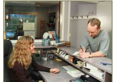
Notice of Privacy Practices